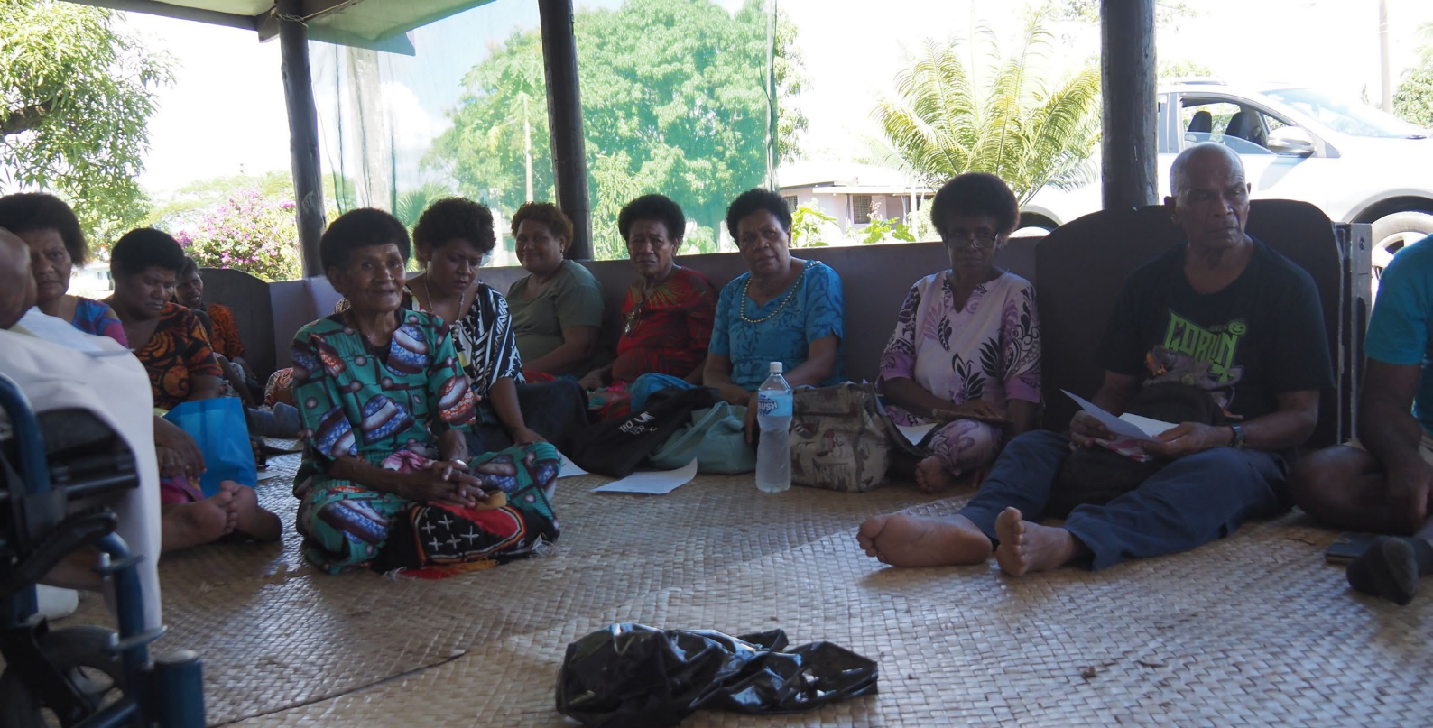
CBID Dialogue in collaboration with ADRA Learning Meeting in Tavualevu, Fiji.

It appears that momentum on CBID has been hindered in recent times where there has been a lack of awareness and understanding of CBID as a foundational approach, insufficient funding for rights-based services at the community level, and gaps in regional networks and coordination. As the stories in this paper demonstrate, where CBID does exist it is transformational, and OPDs are calling for governments and development partners to scale up commitments to renew action in this critical pathway for disability equity and rights.