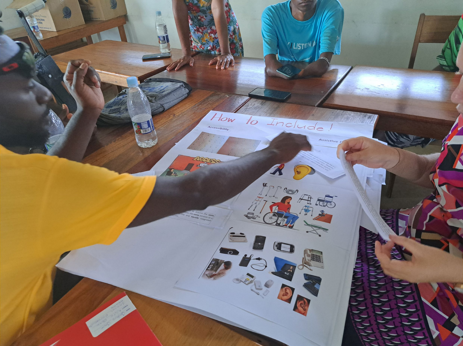
Community Based SRHR Program and Pre-Conditions Awareness Program in Vanuatu.

In the Pacific, CBID may target or have started in one area of the CBID matrix, for example health or livelihoods, as a program and then evolved to connect persons with disabilities with stakeholders and services in other sectors. It is important to note that, while not specifically mentioned within the matrix sub-areas, gender-based violence, sexual and reproductive health and cyber security are priorities for persons with disabilities under the CBID matrix. Programs focused in these areas lend themselves to a CBID approach. Refer Appendix 1 for practice examples across the matrix.