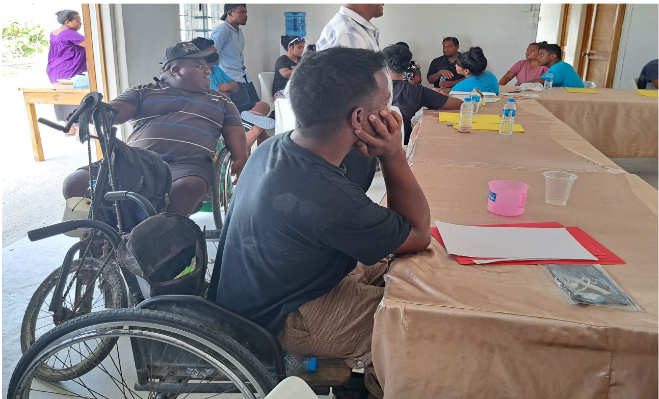
Pre-Conditions Awareness Program in Te Toa Matoa (OPD), in Kiribati.

Empower individual, households, communities, faith-based organisations and community-based DRR and climate action programs to effectively respond to and recover from disasters, ensuring resilience and inclusion of persons with disabilities – particularly women with disabilities and other marginalised persons with disabilities.