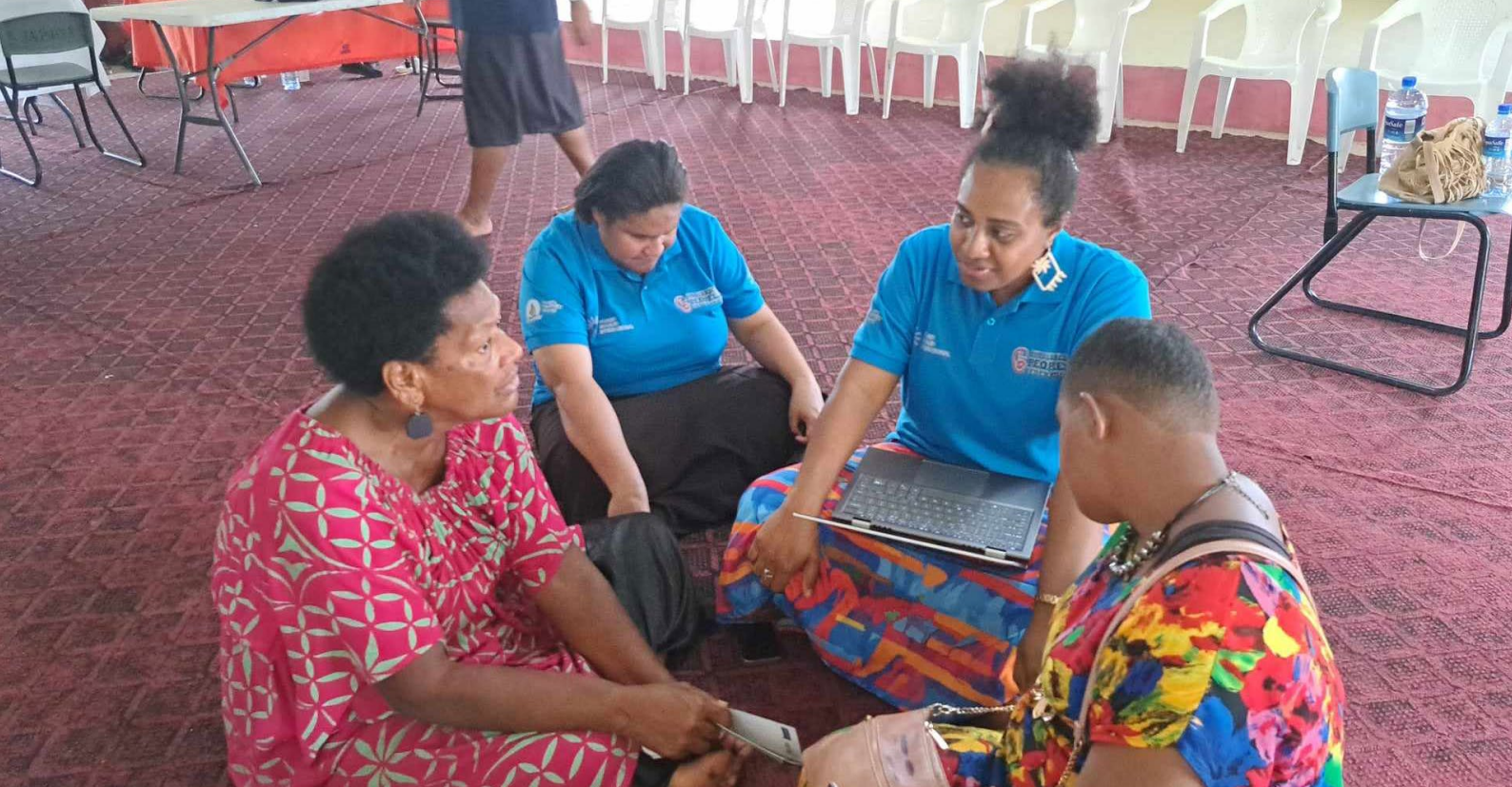
Community Based SRHR Program run by Fiji Disabled Peoples Federation in Fiji.